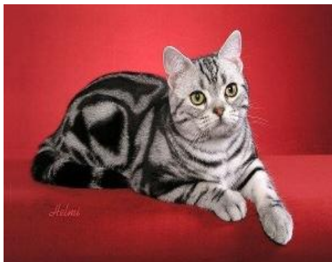
Classic Silver Tabby