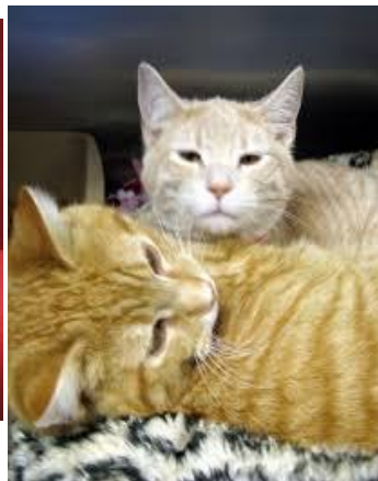
Orange Tabby front, Buff Tabby