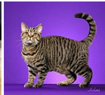
Black/Brown (B/B) Mackeral (striped) Tabby