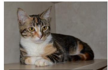
Torbi (Patched Tabby)