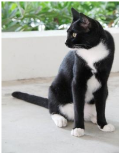
DSH B/W Tuxedo

DSH- Domestic short hair DMH- hair is longer in areas DLH- Hair is long and fluffy everywhere